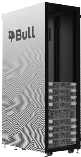
Figure 1. BullSequana SH rack

Coordination between Intel, Bull, and SAP supports the development and validation of infrastructure platforms for SAP HANA deployments. This collaboration includes processor roadmap alignment, system-level testing on BullSequana SH platforms, and verification of SAP HANA-certified configurations. These activities help ensure that new processor generations and scale-up system designs can be deployed within SAP-certified environments as they become available, supporting long-term infrastructure planning for SAP HANA deployments.